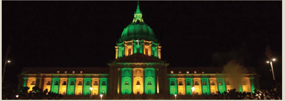
The Mayor's Office lit up City Hall in green and gold in honor of Salesian's 100th Anniversary.